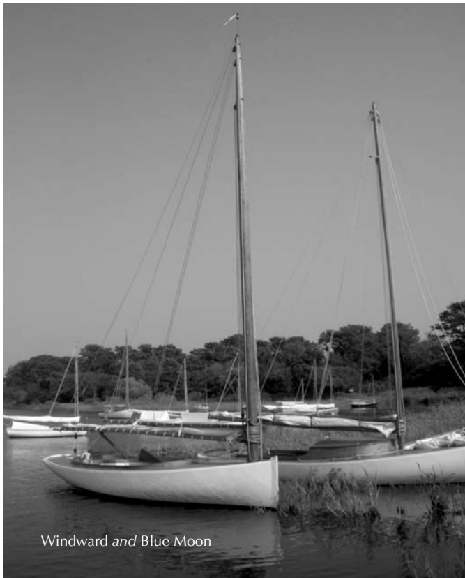
Windward and Blue Moon